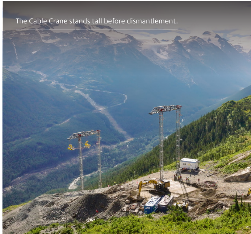
The Cable Crane stands tall before dismantlement.