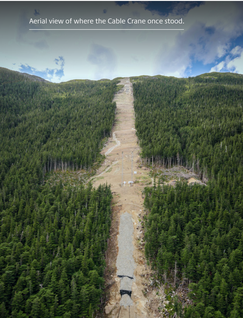
Aerial view of where the Cable Crane once stood.